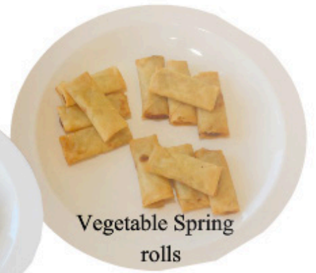
Vegetable Spring rolls