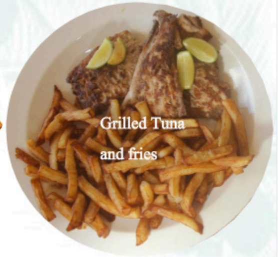
Grilled Tuna and fries