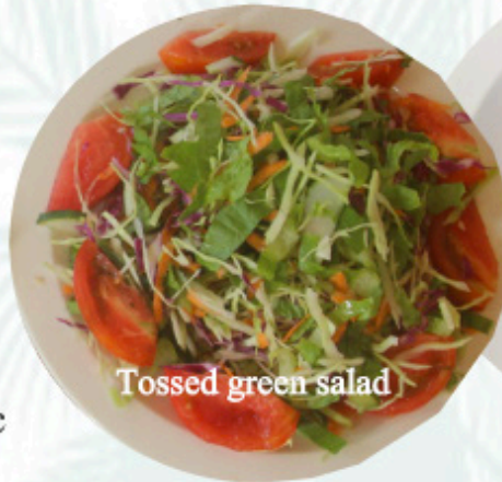
Tossed green salad